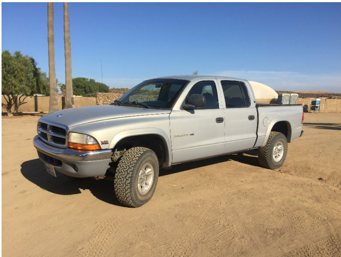
Our newest clinic vehicle, "Mouse"!