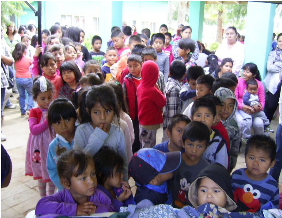
Dozens of families lined up to receive donated backpacks, clothing, school supplies and other donated items