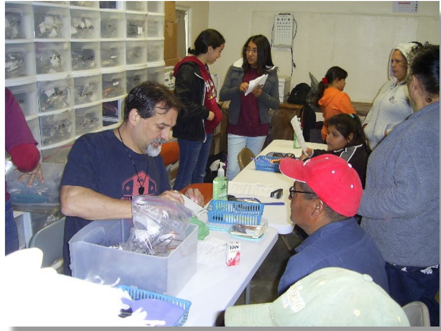
The newly renovated optical clinic is serving patients at an exponential rate

A new record of over 115 exams given to patients in one day!!! 97 exams before noon!!!