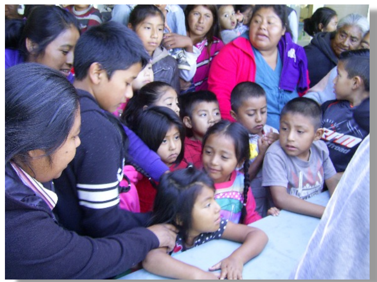
Dozens of local children line up to receive the donations

N ovember Clinic celebrated reaching nearly 2,780 "Backpacks For Baja" distributed to those in need since the program began in 2014!!!