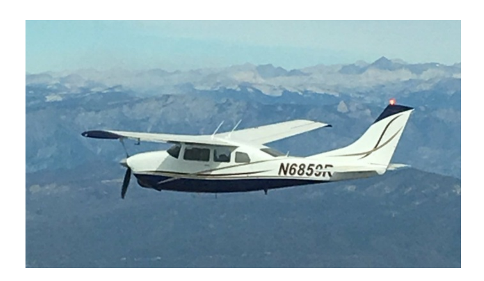
N6859R sporting a fresh paint job en route to clinic