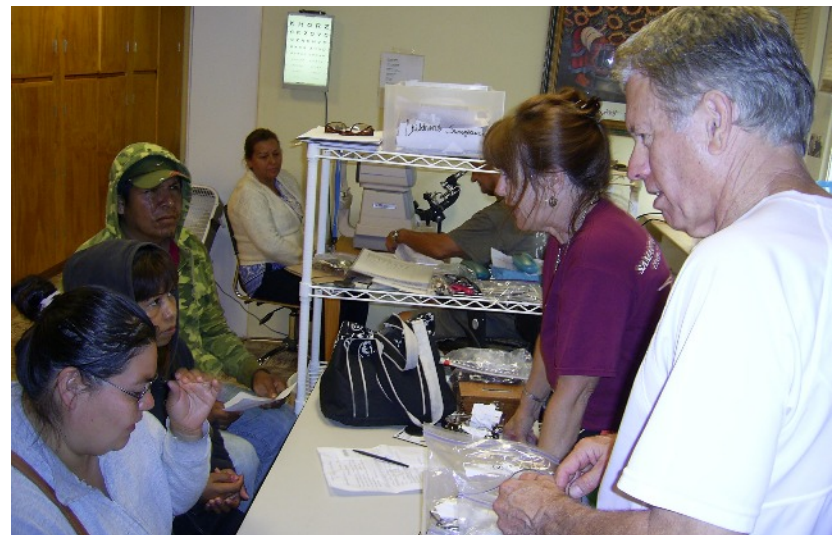
Patients wait to receive properly fitted glasses shortly after their exams