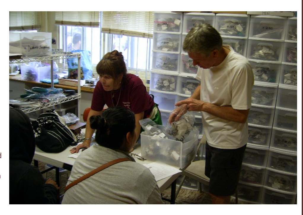
Distributing pairs of donated glasses to patients

We also received a donation from Debi Amaral with VSP of 100 pairs of high end sunglasses that were a huge hit particularly with the Women who appreciate the styles and quality that we would not normally be able to provide!!!