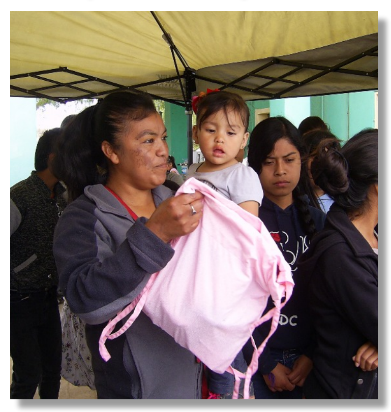
Loving their new toys and backpacks

Other volunteers also distributed many donated items. Included were handmade dresses that were made and/ or acquired in support of the "Dress A Girl Around The World" initiative. This initiative is designed to provide at least one nice dress to as many young girls as possible to build Dignity, Health, Joy and Love. There was also a distribution of hundreds of Men, women and children's clothing items which were greatly appreciated by the thankful recipients.