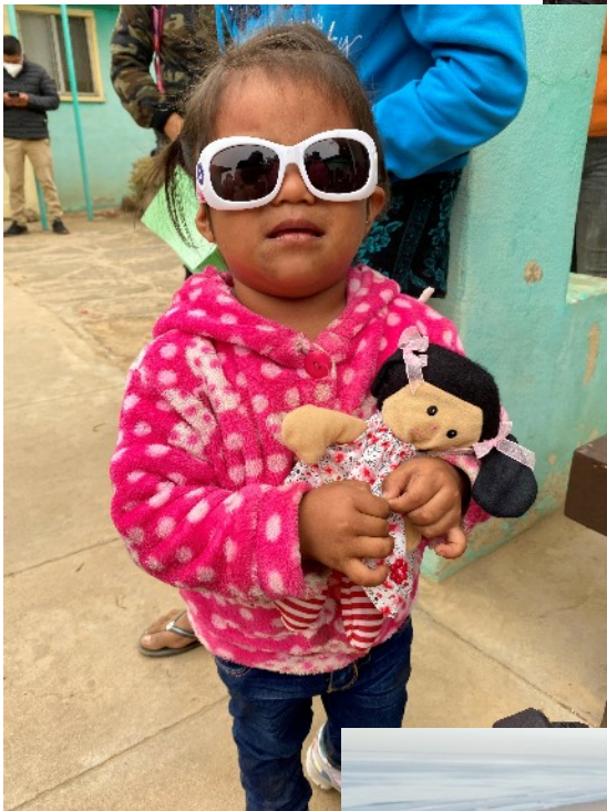
One of our young patients.

For more information, email: membership@flyingsamaritansmotherlode.org